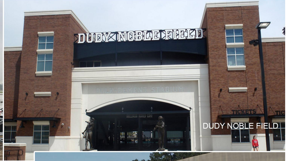
DUDY NOBLE FIELD