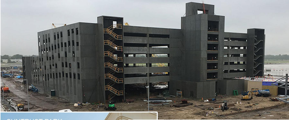
LOUIS ARMSTRONG INTERNATIONAL AIRPORT