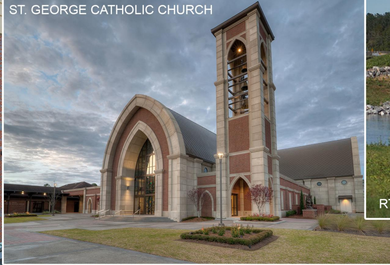
ST. GEORGE CATHOLIC CHURCH