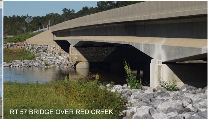
RT 57 BRIDGE OVER RED CREEK